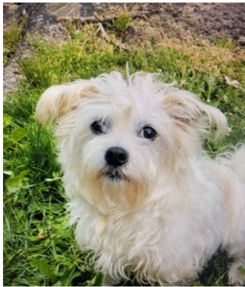
Sonny...loving his new life