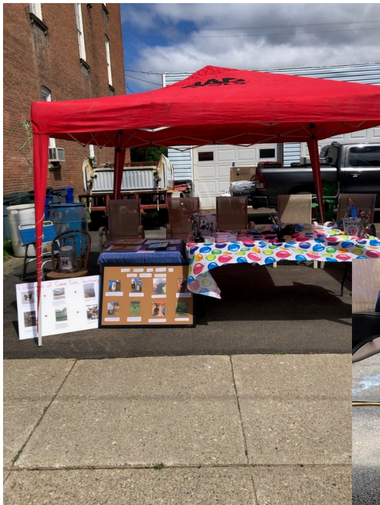
Getting the word out