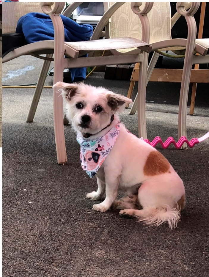
Sonny, a dog CCLS helped save, is now living the good life!