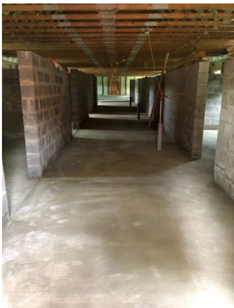
Concrete block walls completed.

Our next step in Phase 2 is to secure electricity, which has been estimated at $4,000.00. After that, the sewage system will be completed. Finally, heat and the preparation of the first two rooms will need to be completed before we are able to accept our first rescues.