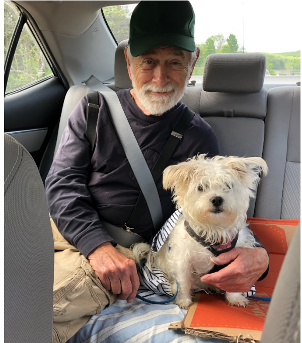
Night of the rescue. All Sonny needed was someone that cared.